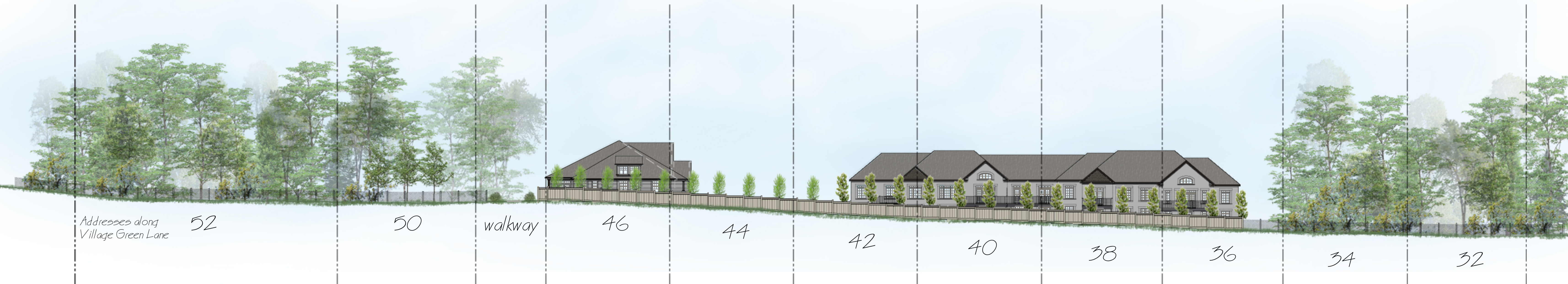
BUFFER - IMMEDIATELY AFTER PLANTING